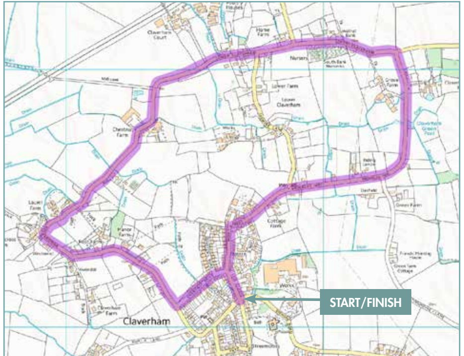
This map is for guidance only and walkers should carry and use the OS 1:25000 map when out. You are not permitted to copy, sub-license, distribute or sell this data to third parties in any form.

to a t-junction. Turn left here and continue past some nurseries.