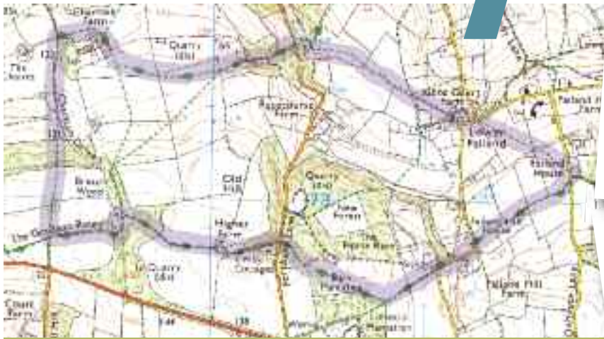
You are not permitted to copy, sub-licence, distribute or sell this data to third parties in any form.

Enter the Downs School playing fields and head for the gate in the right-hand corner beyond the pavilion. Follow the vehicle track past the school buildings on your left. At the crossroads in the drive, turn left. Keep your eyes peeled for the stile in the fence on the right between two large trees. Cross the stile and carry on towards the yellow house. Cross the stile behind the house along a narrow fenced path and onto the track uphill. Cross another stile into an open field and go straight on through a small copse of trees, continuing the other side. In the next field turn left keeping the hedge on your left. Follow the signs and arrows through three wooden gates. Look out for alpacas, goats and a donkey as you pass behind the house to your left.