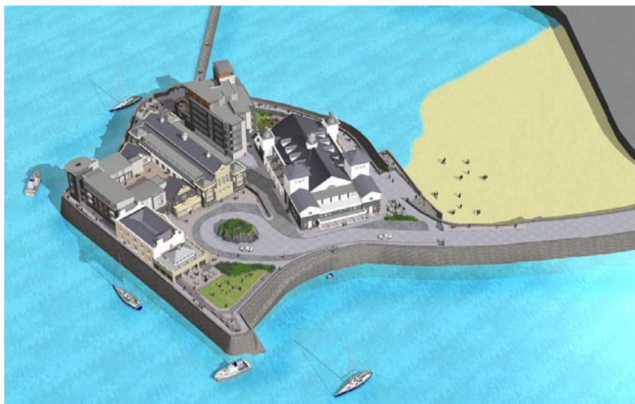
Computer generated image showing the development proposal for Knightstone

The public realm element of the project is being delivered through the WCPI at a cost of £1.25 million, and will provide an upgraded and accessible public walkway around the island as well as enhance the green and carriage drive areas. The design of the public areas is influenced by the natural coastal features, with formed rock outcrops providing new areas to sit and enjoy the views. A major part of these funds will be used to introduce an element of public art. The project aims to create a high quality environment that will help rejuvenate the seafront and continue to attract visitors. The project is due to be completed by Spring 2007.