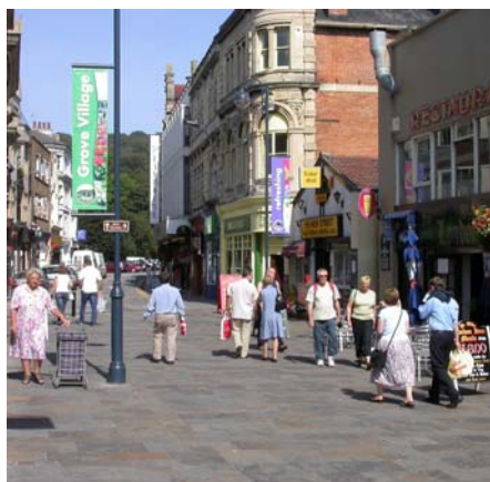
Pedestrianising this part of High Street has improved pedestrian access to Grove Village

The key aim of the works at Grove Village is to establish this area as a cultural destination within Weston. Phase I of the works, costing in the region of £300,000, managed to create a clear and safe pedestrian link from the main High Street shopping area through to Grove Park. Creation of a high quality street environment was possible with the use of natural stone paving and upgrading of existing footways.