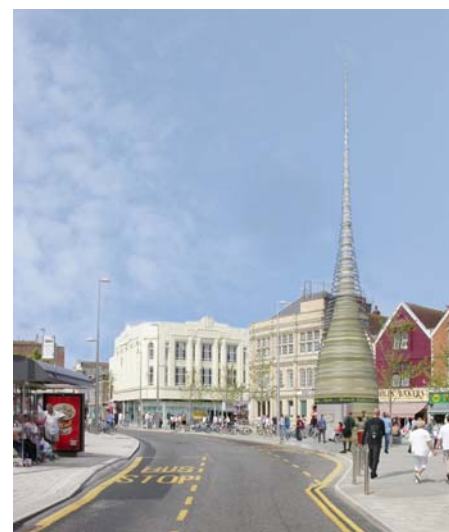
Computer generated image of 'Silica' at Big Lamp Corner

The second phase of works at Big Lamp Corner involves the installation of an iconic piece of public art that will draw people into the space from the seafront and High Street. 'Silica' is the creation of Nottingham-based artists Wolfgang & Heron leading a team consisting of Price & Myers (Structural Engineers) and Conran & Partners (Architects). It is a 26.0 metres tall, illuminated spire, made of reconstituted stone and stainless steel. The use of thousands of glass prisms means that the artwork will reflect skylight / sunlight during the day and be transformed with the use of coloured electric light by night. This part of the project will cost £280,000. The planning application was submitted at the beginning of September and the artwork will be installed on site in March 2006.