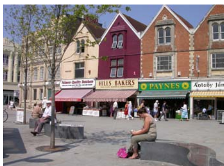
Big Lamp Corner is now a key pedestrian focus within the town

The work has incorporated natural stone paving, new benches, tree planting and upgrading of surrounding footpaths and street lighting. LED lights incorporated in the space are programmed to change colour and add interest at night time.