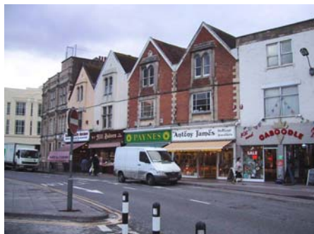
Before the work at Big Lamp Corner, this area was a tight road junction which was dominated by through traffic

The work at Big Lamp Corner, costing in the region of £750,000, is the first of 11 projects to improve the quality of open spaces in Weston.