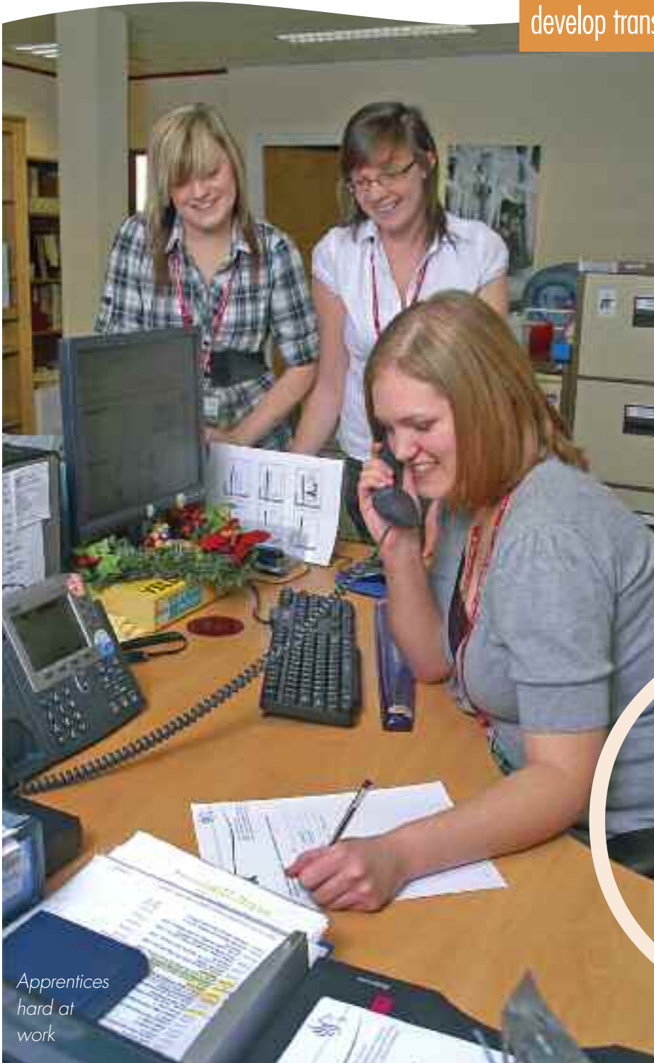
Apprentices hard at work

Young people are among the hardest hit during the recession and competition for jobs is fierce – so there's never been a better time to develop transferable skills and qualifications.