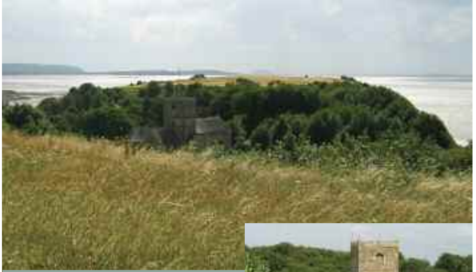
St Andrew's churchyard

Salthouse Fields Car Park off Old Church Road, Clevedon