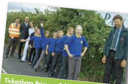
Tickenham Primary School park and stride scheme; improved Clevedon Road footpath leading to the Garden Centre