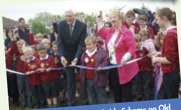
Locking School's Park & Stride Scheme on Old Banwell Road official opening event in May 2010

Banwell Primary ran their regular "Wheels on Wednesday" and St George's Primary, Hillside First and Becket Primary in Worle, along with Mary Elton Primary in Clevedon all organised walking buses during the week.