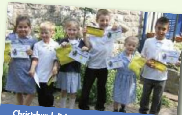
Christchurch Primary School Weston-super-Mare celebrating walking 1016 miles during national Walk-to-School Week

Uphill Primary aimed to get all of their children using green travel by using a passport scheme throughout the week and inviting everyone to walk to school from the beach on Wednesday morning.