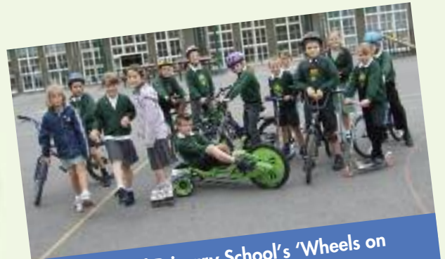
Banwell Primary School's 'Wheels on Wednesday' event

Green Travel Awards were presented to Hillside First School, Kingshill Primary and Uphill Primary for gaining 100% of pupils using green travel during the week and their continued commitment to Walk to School Week.