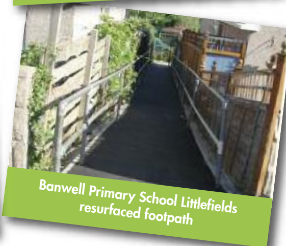
Banwell Primary School Littlefields resurfaced footpath