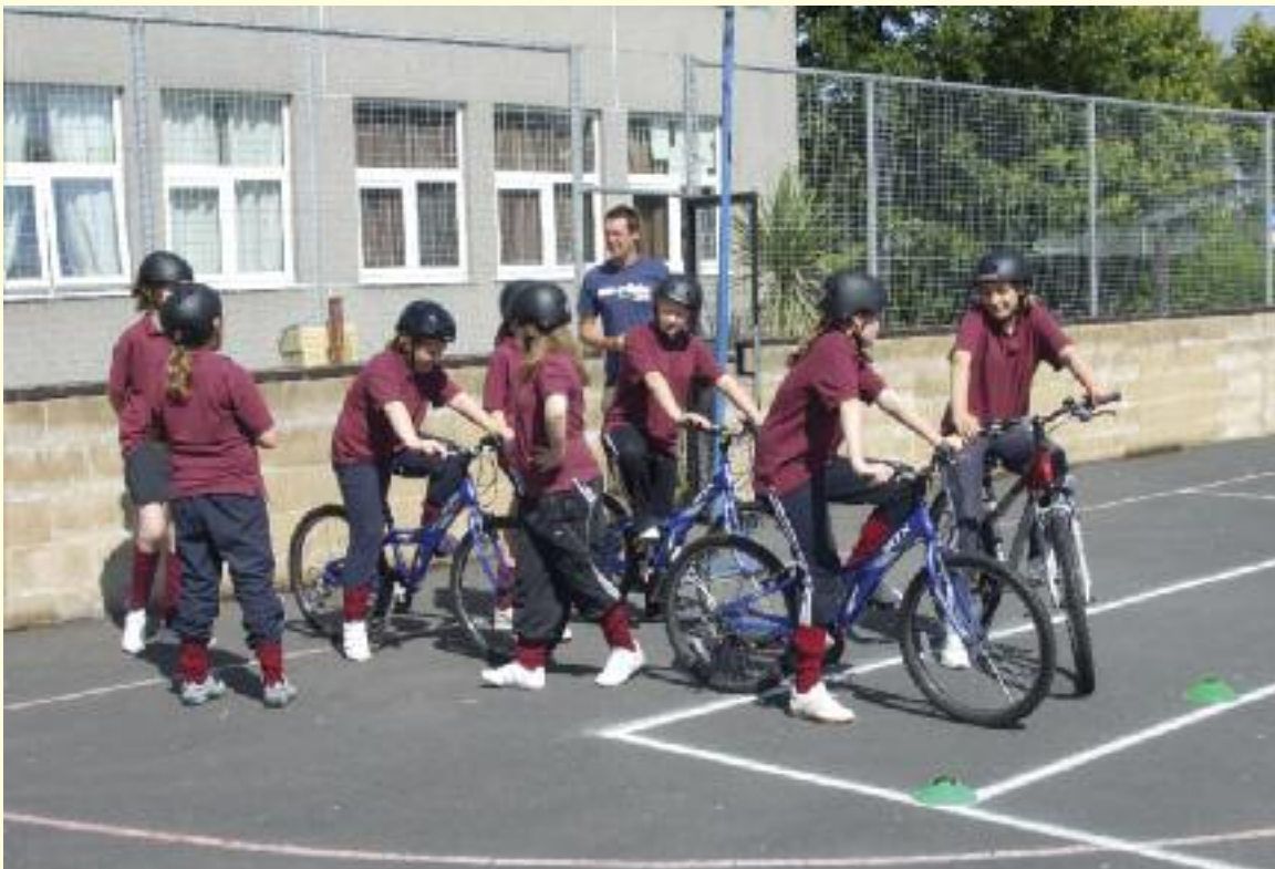
Go-Ride training at Wyvern School Weston-super-Mare

Tel: 01934 425 510 or by e-mail marc@sole-events.co.uk or visit www.sole-events.co.uk