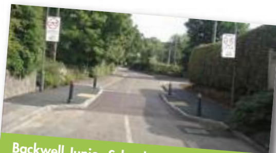
Backwell Junior School's 20mph initiative