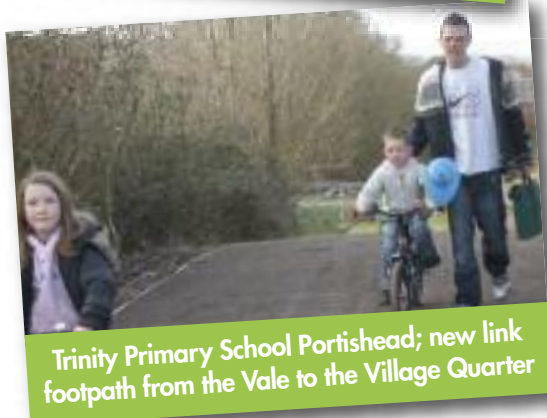
Trinity Primary School Portishead; new link footpath from the Vale to the Village Quarter