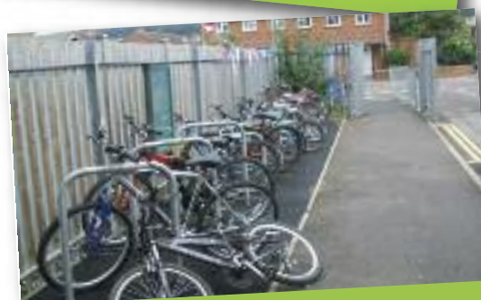
Ashcombe Primary School Weston-super-Mare; additional cycle stands and driveway improvements