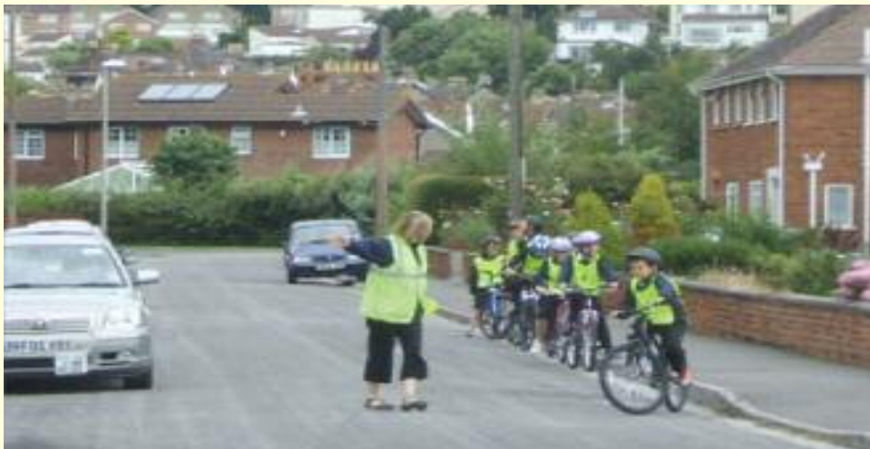
Ashcombe Primary School Weston-super-Mare undertaking cycling tuition during June