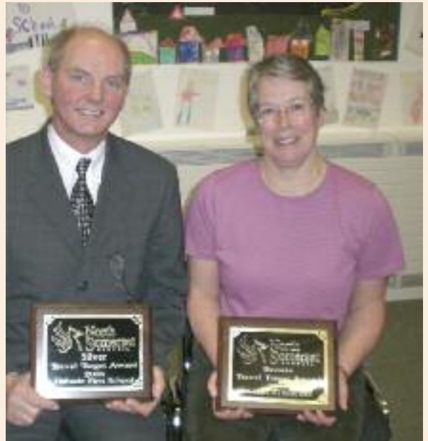
Travel target award plaques presentations to Hillside First School and Northleaze Primary School